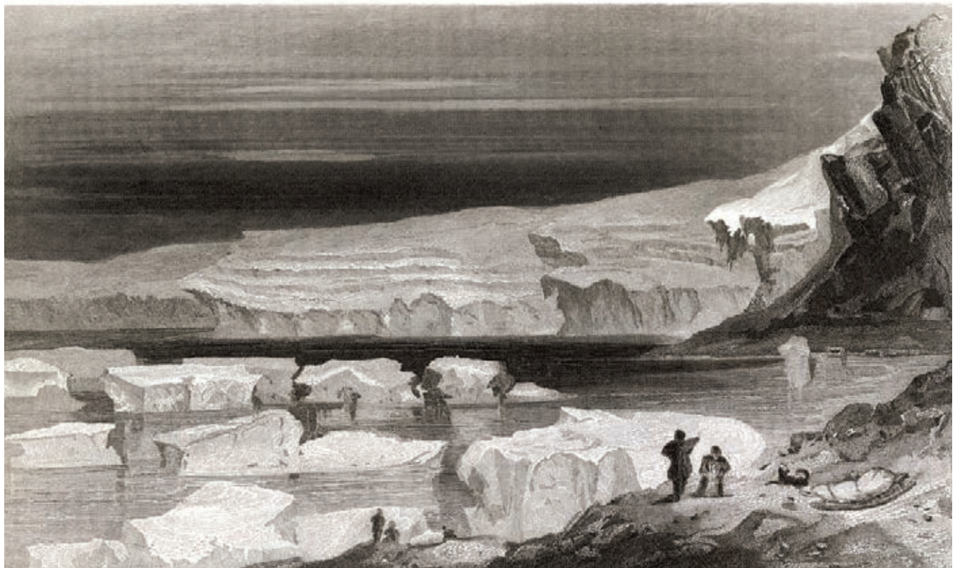
GREAT GLACIER OF HUMBOLDT

To vindicate herself—and make some money—Fox authorized publication of The Love-Life of Dr. Kane , a collection of Elisha's letters to her. But her timing was off: The book came out in 1866, by which point the once-glamorous couple was old news,