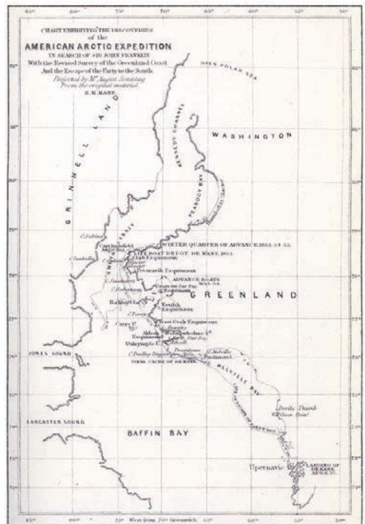
Kane's gripping account of his Arctic expedition in search of the English Explorer Sir John Franklin was enlivened by numerous steel engravings based on the author's on-the-spot-sketches.

Next he was off to the Arctic. This phase of Kane's life, which began in 1850 and lasted until the end, was occasioned by the disappearance of English explorer Sir John Franklin while searching for the elusive Northwest Passage. Under Franklin's command, two ships had set sail in 1845; nothing had been heard from them since. The First U.S. Grinnell Expedition, to which Kane was detailed as surgeon, failed to find the missing Brits, but Kane came back infatuated with the Arctic. The account he wrote of the voyage was a warm-up for his later masterpiece about his own expedition.