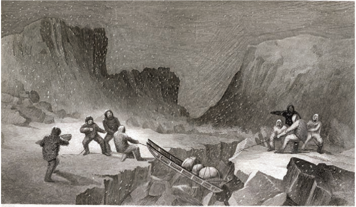
CROSSING THE ICE BELT AT COFFEE GORGE

While Kane was reconnoitering the top of the world, his future wife was trafficking with ghosts. Maggie Fox came from a humble background in rural upstate New York. At home one night in 1848, she and her sister Katy noticed that they had extraordinarily flexible toes, which they could snap smartly against one another inside their shoes. Their superstitious mother concluded that a spirit was making these “rappings,” which contained messages her girls could decipher. Maggie and Katy played along, and soon they were the talk of the neighborhood.