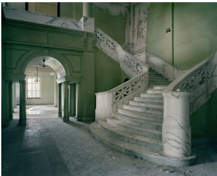
Patient toothbrushes, Hudson River State Hospital; ward hallway, Fergus Falls State Hospital; lobby and staircase, Yankton State Hospital.

Both of Payne’s book projects have involved structures designed for a very specific purpose. “I’m very much interested in these [types of] purpose-built structures that have an architecture that goes with them,” he says. “Most of the things that are built now are mixed-use, retail, condominiums—everything is meant to be flexible. There is a sense of permanence to these older buildings that is very appealing.”