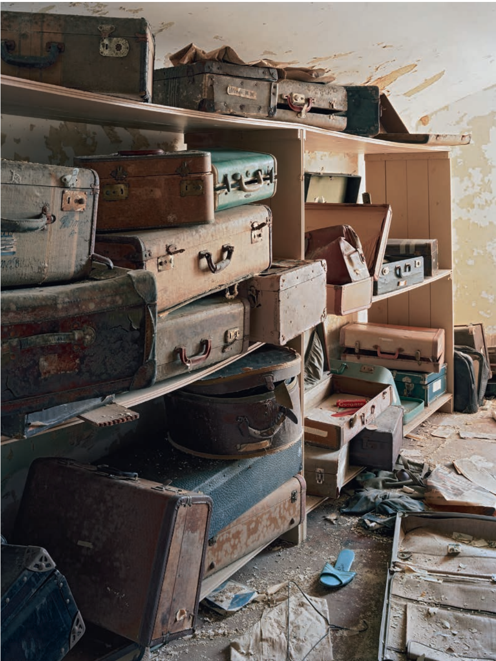
Unclaimed copper cremation urns, Oregon State Hospital; nurses station, Central State Hospital; patient suitcases in ward attic, Bolivar State Hospital.

While there were “amazing shots everywhere I looked,” Payne says, his main goal was to find images that evoked the sense of the patients’ lives in these vanished worlds. “At the end of the day, I wanted each photograph to tell a story about the lives lived there. Each photograph should be able to stand on its own as an art shot but also be unique and reference all the other hospitals.”