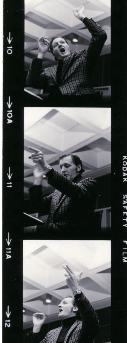
KODAK SAFETY FILM

By the end of 1865, the Glee Club had 20 members—more than any of the campus fraternities. (Remember that in those days, each class had only about 25 students.) It had also added a full board, including a business manager, and received top billing in the yearbook's "University Record" of campus happenings. There, the group is described as