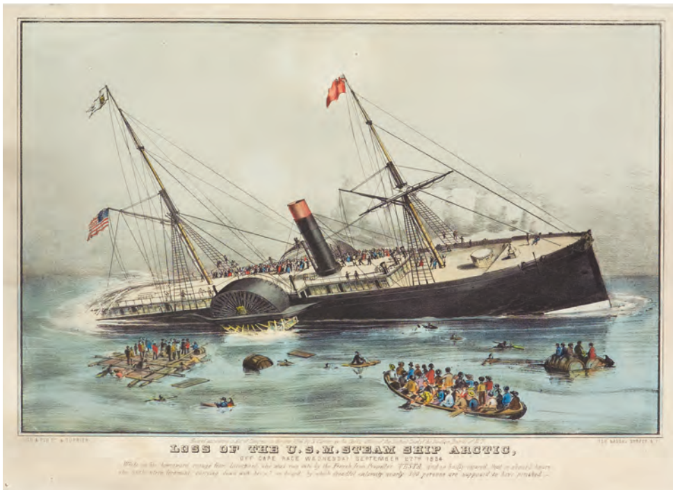
Loss of the U.S.M. Steam Ship Arctic, 1854. Published by Nathaniel Currier.

tures on English History and Tragic Poetry as Illustrated by Shakespeare , both of them reaching to more than 400 closely printed pages.