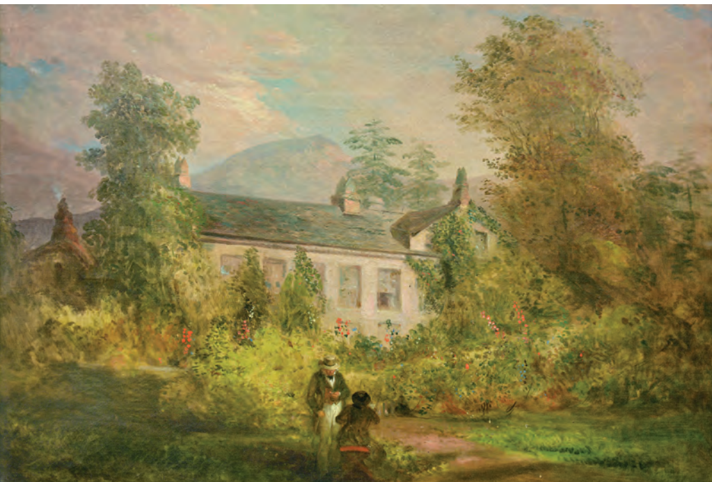
Painting of Rydal Mount, Wordsworth's family cottage, and the poet's favorite portrait of himself, both by Henry Inman.