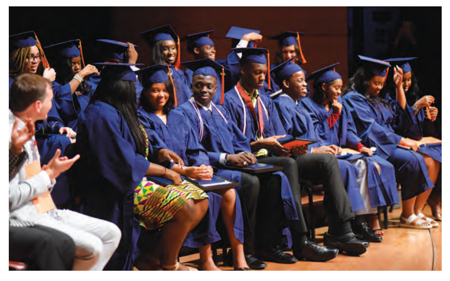
As part of the festivities marking Success Academy's first graduating high school class—all 16 of whom have been accepted at four-year colleges—the charter network commissioned Success Stories , which recasts the students' college essays in graphic-novel form.