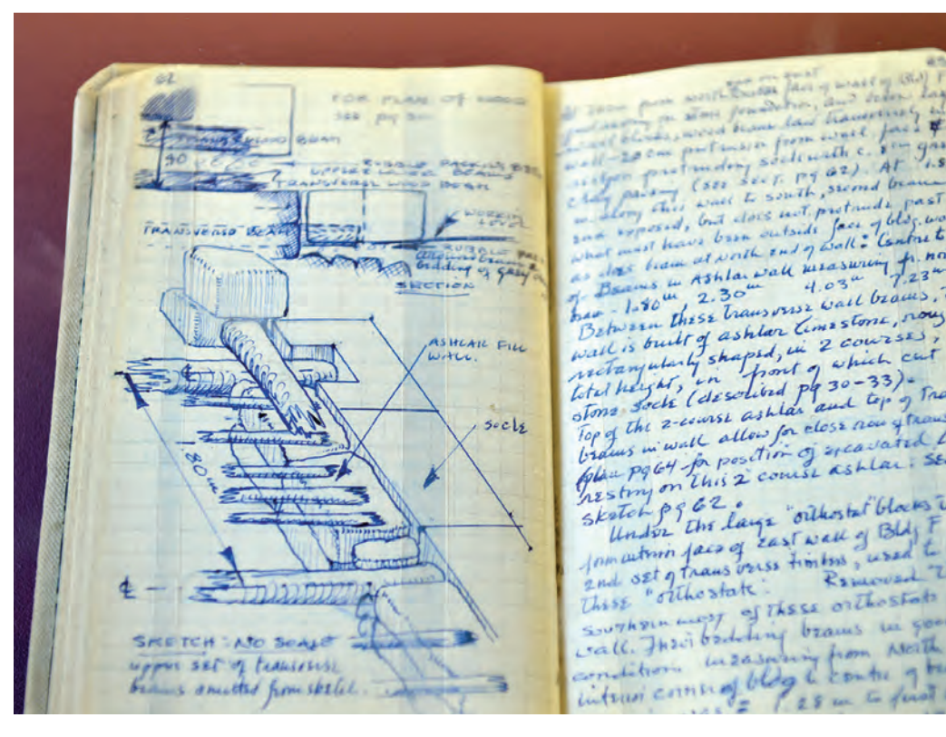
Every archaeological supervisor at Gordion has kept excavation-trench diaries; there are more than 200 in all. These pages, written on April 30, 1961, document excavations of the Citadel Mound, including a sketch of one of the buildings being uncovered. Right: Ceramic krater, ninth-eighth century BCE; its distinctive painted decoration was rare in Gordion. A model shows what the eastern part of the Early Phrygian (pre-Midas) citadel at Gordion might have looked like before a destructive fire in 800 BCE.

One of the largest objects in the show is what Rose describes as an "elaborate Assyrian relief of a winged man with