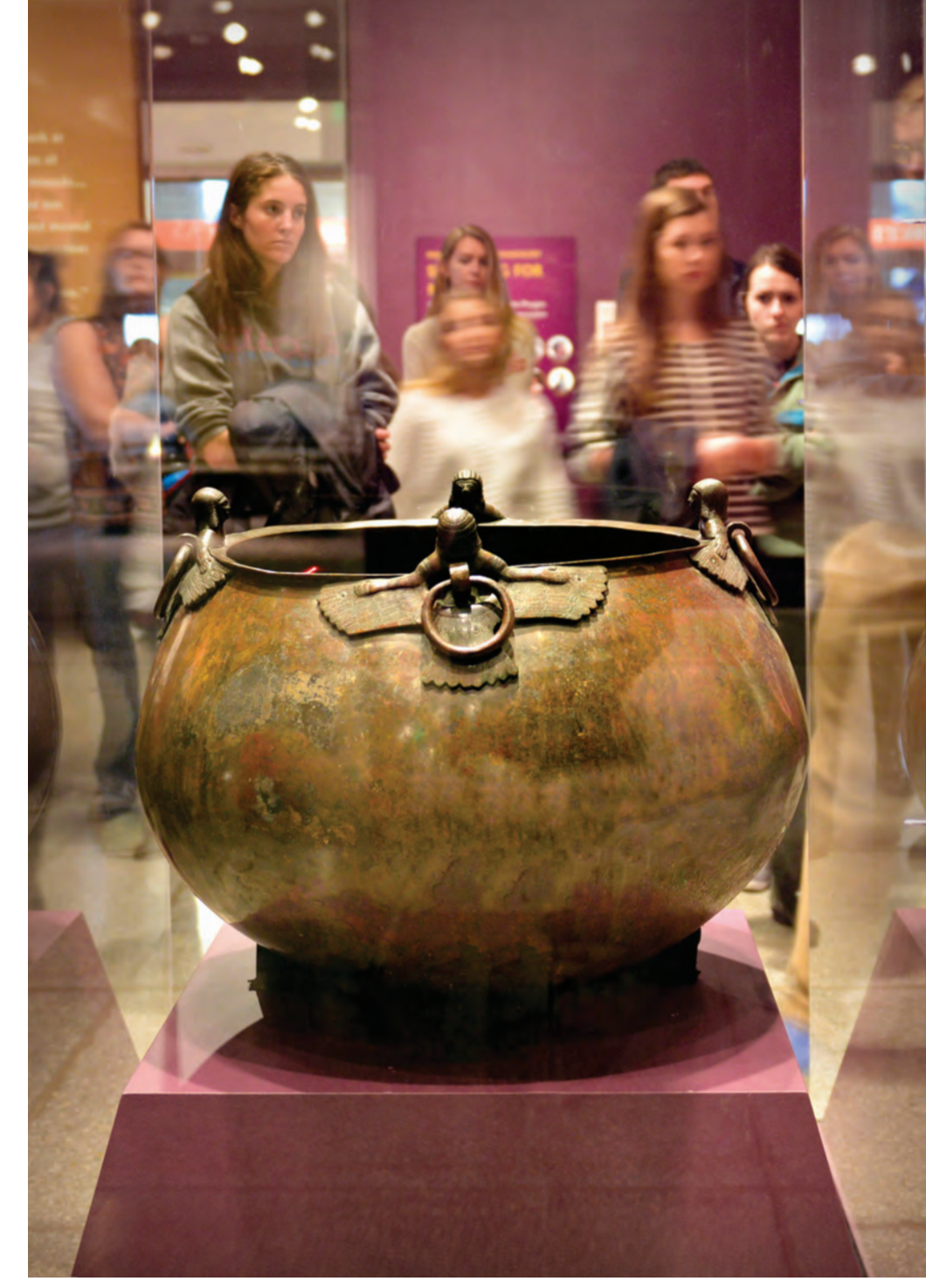
Previous pages: Bronze jugs and drinking bowls, ca. 740 BCE, discovered in Tumulus MM, the Midas Mound. Above: Large cauldron with siren and demon attachments—probably intended to inspire awe and offer protection to the deceased—used to store liquids for the funerary feast.

To the delight of Penn's excavators, the royal tomb was found intact in 1957. Within the so-called Midas Mound lay a