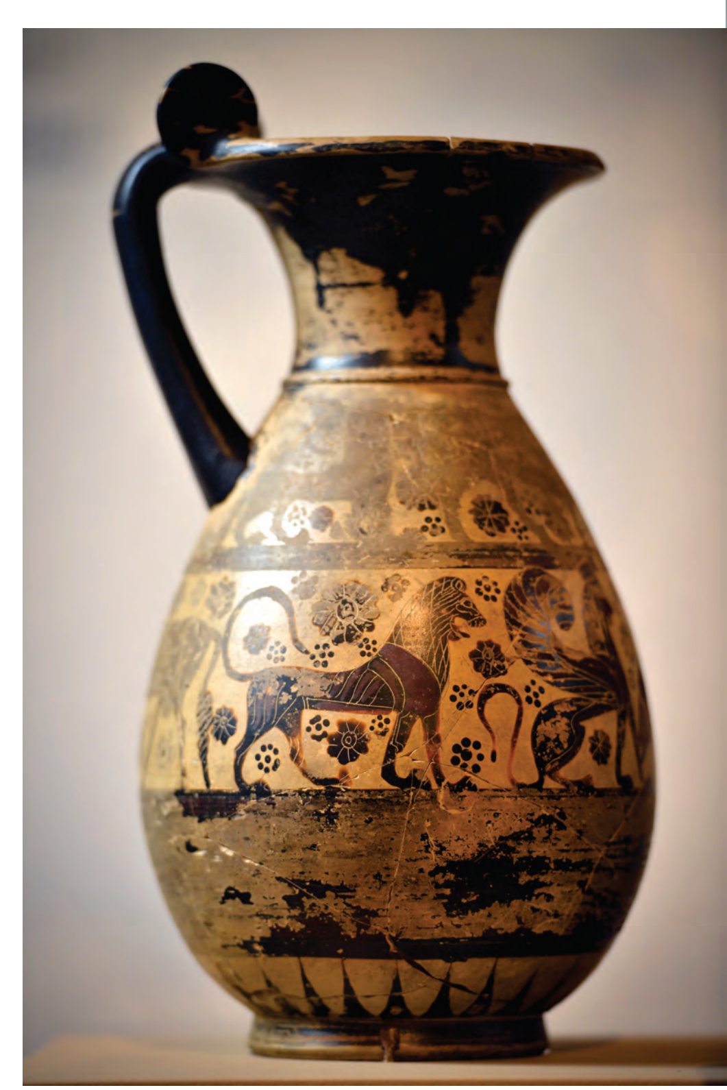
Ceramic wine pitcher, 620-590 BCE, from the Mediterranean islands, representative of the "Orientalizing" style of Greek pottery. Black polished goat jug, 770-760 BCE, one of several animal-shaped ceramic vessels found in Tumulus P at Gordion. Marble Persian head with tiara (symbol of power and sovereignty), late sixthearly fifth century BCE.

Young thought he had uncovered the tomb of Midas himself. But dendrochronology (tree-ring dating) and radiocarbon dating eventually indicated that its construction was several decades too early. Its size and splendor nevertheless marked it as royal, almost certainly the resting place of Midas's father.