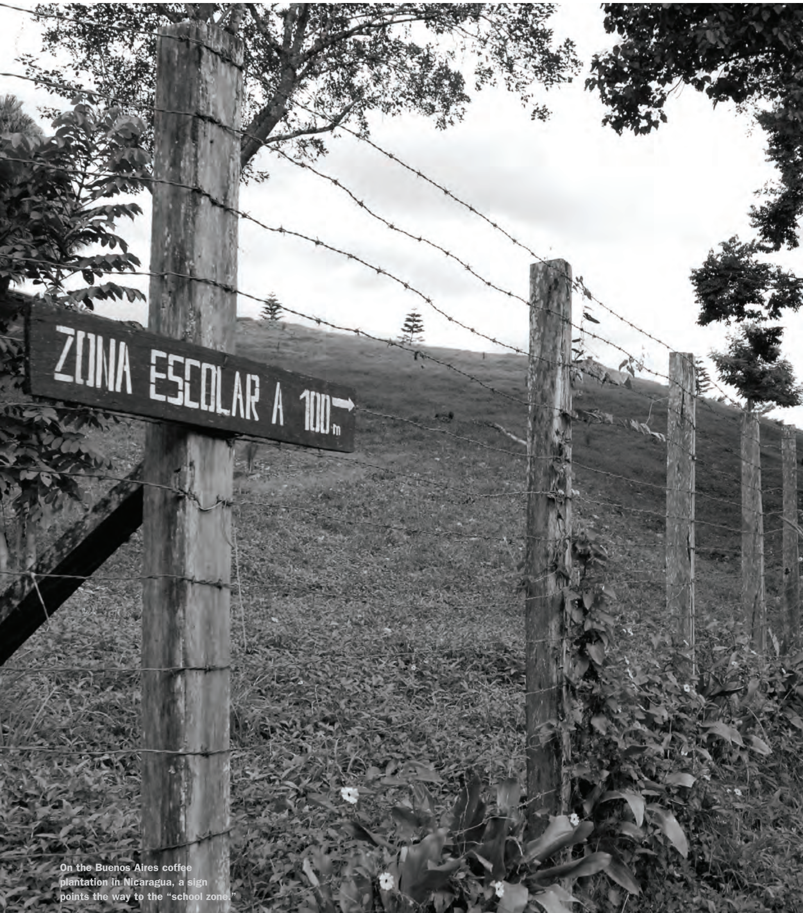
On the Buenos Aires coffee plantation in Nicaragua, a sign points the way to the “school zone.”