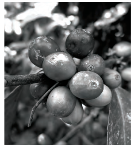
A technologically literate workforce is becoming more important as growers seek to measure the impact of inputs—wind, soil, sunlight, pruning schedules, and worker incentives—on the number and quality of outputs—ripe, pre-milled coffee beans, known as “cherries.”

eracy crusade” reduced analfabetismo from 50 percent to around 10 percent. At that time, only 38 percent of children were enrolled in primary school. By 2006, when the Sandinista leader Daniel Ortega was reelected President, the rate of enrollment had doubled. He declared primary education a basic right and set the goal of 100 percent matriculation by 2012. But government investment in schools, at 3.7 percent of GDP, isn’t nearly enough to