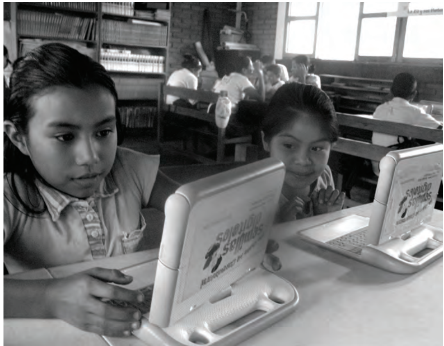
Two children try out the XO laptops.

“I’m an education professor at an Ivy League university in a large city. We can’t even get our own school system together,” Ravitch says. “So what makes me an expert? Who am I to bring something to